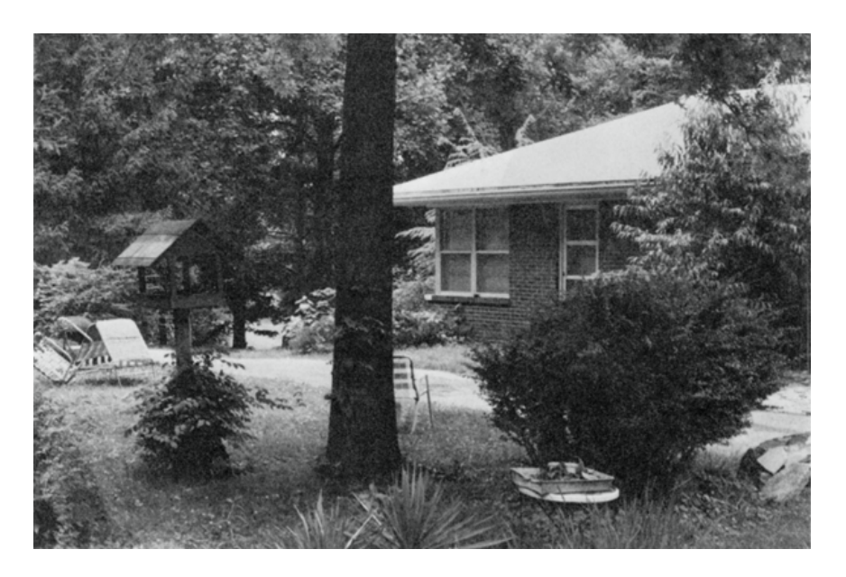
The exterior of the Ra room: the door and corner windows are part of the outside of the room in which the Ra sessions have taken place since January 1981. ( Photo taken June 9, 1982. )