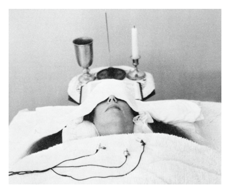
RA, Session No. 2, January 20, 1981: "The instrument would be strengthened by the wearing of a white robe. The instrument shall be covered and prone, the eyes covered." (Photo taken June 9, 1982.)